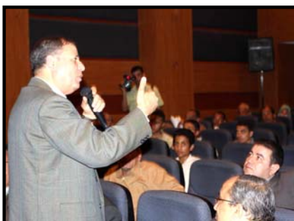
The General Secretary of Menofiya Governorate endorsing the AI Theater Play.

"Chickens are the feathers in the farmer's cap," commented one participant at a village meeting, referring to the pride that locals take in their household poultry stocks. Community level AI activities facilitated by CHL aim to support rural families to raise healthy birds. Said one volunteer with the AI team, "We don't want you to kill your birds. We want to help you keep them safe." The play Chickens and the Neighbors is being performed in villages throughout upper Egypt in cooperation with governorate cultural centers.