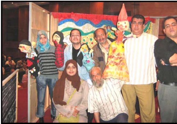
Performers from the Menofiya Cultural Center and "Arrayis" (puppets) backstage at the premiere of the Avian Influenza play in Menofiya.

"Chickens and the Neighbors" will be showing in villages throughout Egypt as part of the national Avian Influenza communication campaign.